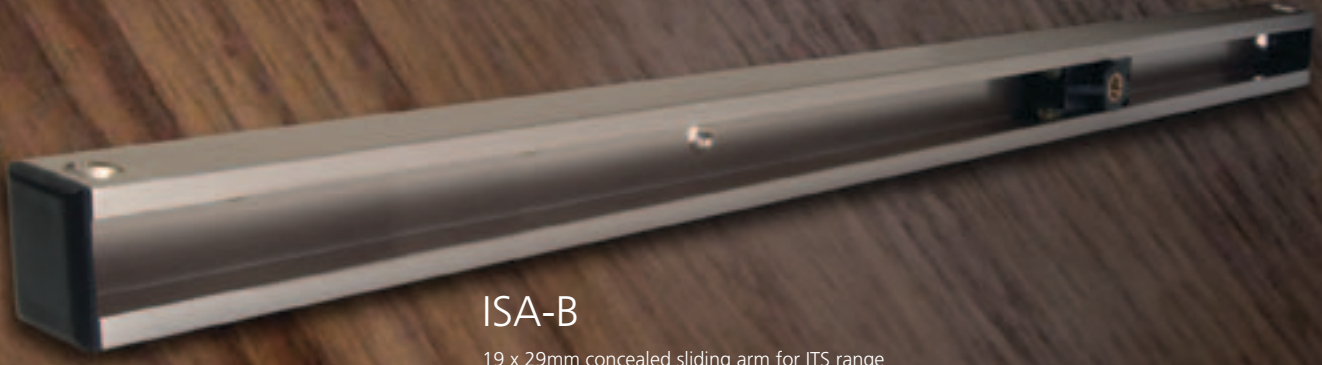
ISA-B 19 x 29mm concealed sliding arm for ITS range