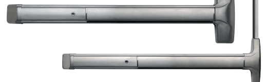
50 SERIES (Narrow Stile)