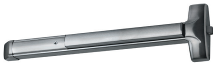
10 SERIES (WIDE STILE)