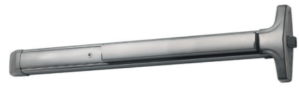
40 SERIES (NARROW STILE)