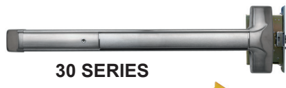
30 SERIES (MORTISE)