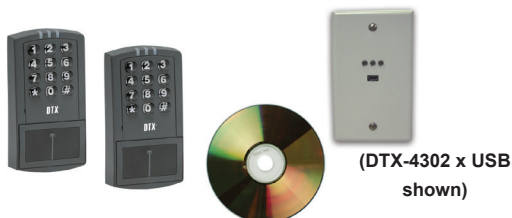
(DTX-4302 x USB shown)

DTX-4300 Multi-Door Proximity Reader/Keypad (USB or Network) - Provides a fully integrated PC managed multi-door system and standard access control functionality. The software allows the management of people and doors through easy to create reports and step-by-step wizard assisted expanded features. Software communicates to the DTX-2300 either by LAN/WAN or RS485 connection. The IEI electronics for each keypad are conformal coated to provide excellent protection from the elements for Indoor/Outdoor use.